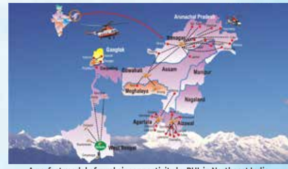
A perfect model of rural air connectivity by PHL in Northeast India.

The city of New Delhi is not only India's capital but also a political and business hub of the country with numerous companies (national & International) dealing in diverse type of businesses and trade. The city other than being the commercial centre of North India is also one of the major aviation hubs in the country and a growing tourist and trade show destination. The capital is connected with all the other Indian cities as well as different countries across the globe with numerous international and domestic airlines, companies and allied industries also headquartered in New Delhi.