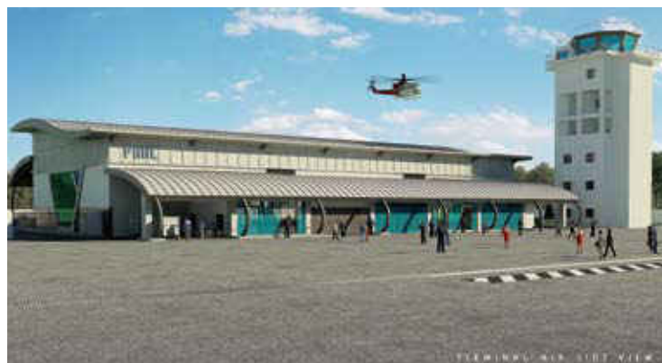
Nations First Heliport at Rohini, Delhi

Most of these unused airports/ airstrips have runways of 1000 mt to 1100 mt length which are reasonably suitable for operation of small 18-20 seater aircrafts. The New Civil Aviation Policy of Ministry of Civil Aviation has put lots of emphasis to improve regional air-connectivity in Tier-II and Tier-III cities. It is a huge market. Pawan Hans is looking at routes/ places where it can be developed as sustainable and